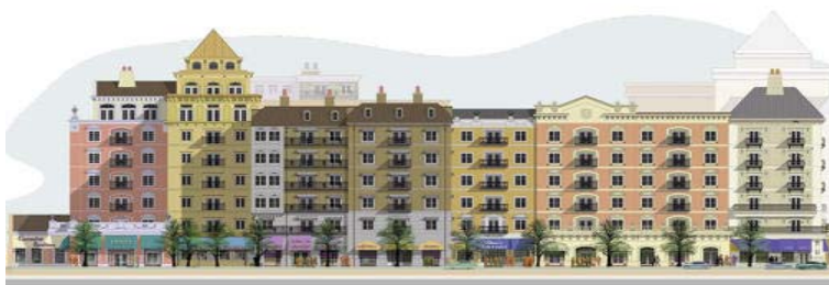
Conceptual view of North Elevation at Carmel City Center on City Center Drive